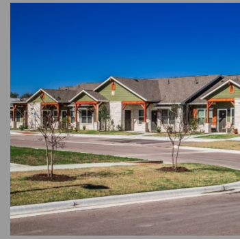
Highlander Senior Village Bulverde, TX

48 Senior Units Located in a Three-Story Building