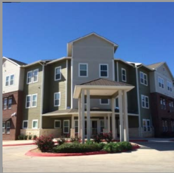
Riverwood Commons Bastrop, TX

36 Senior Units Located in a Three-Story Building