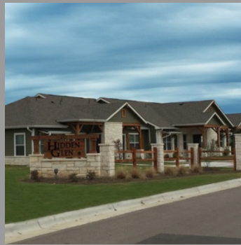
Hidden Glen Salado, TX

36 Senior Units Located in a Three-Story Building