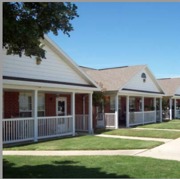
Settlement Estates Bastrop, TX