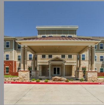
Bluff View Senior Village Crandall, TX

48 Senior Units Located in a Three-Story Building